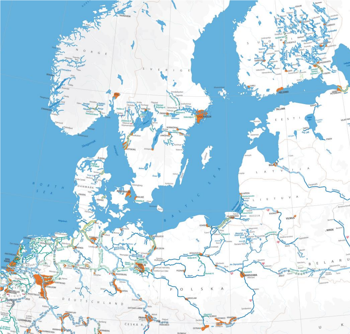
FIGURE 2 - IMPORTANT ECONOMIC AREAS CONNECTED TO INLAND WATERWAYS. REMARK FOR SWEDEN: INLAND NAVIGATION IS TIME BEING ALLOWED IN LAKE MÄLAREN AND LAKE VÄNERN INCLUDING GÖTA RIVER.

Using inland navigation and river-sea shipping is a way to shift transport of goods from road to waterways in future. The navigable inland waterway network within the EU exceeds 40 000 km 5 and covers all important economic areas in Central Europe. Many industrial and population centres are located along inland waterways. Half of Europe’s population lives close to the coast or to inland waterways and most European industrial centres can be reached by inland navigation and river-sea shipping.